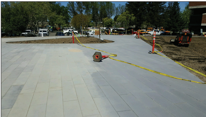
An efflorescence removal job in progress; before (left) and after cleaning (right).

No. These can be found at your local masonry dealer. Eagerly, we'll refer you to a Stepstone Dealer in your area within the state of California.